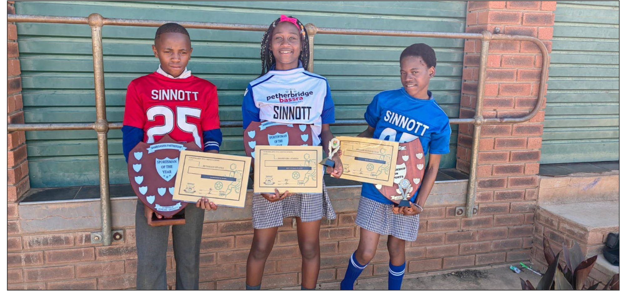
Vumanhlamvu Primary School Jordan Sinnott Award Winners 2022