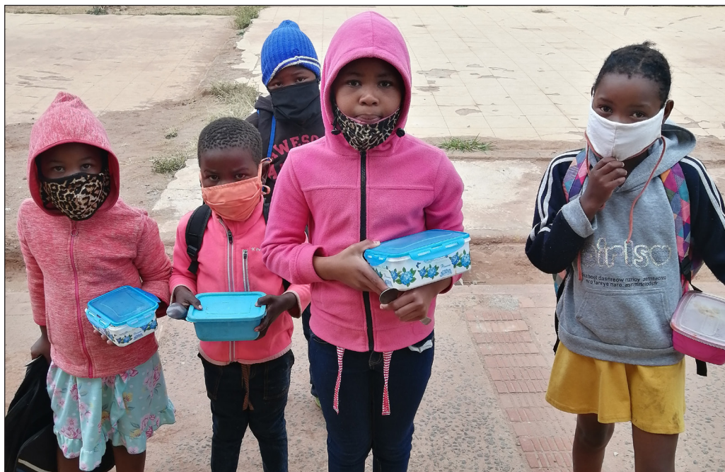
Wild fires left ten families homeless in the rural, remote Nkandla region in South Africa