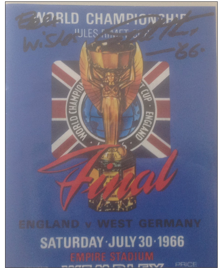
The World Cup programme which was auctioned to raise funds