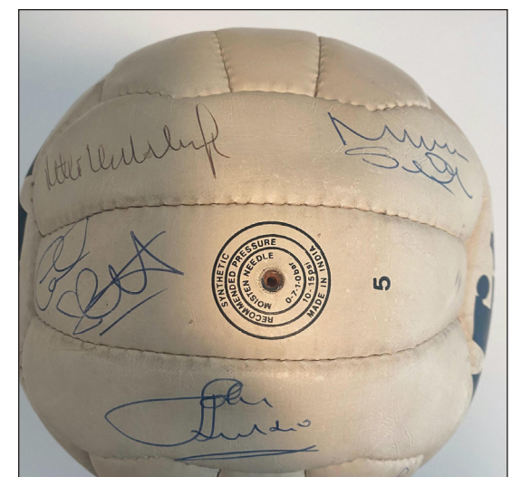
The Leeds United football