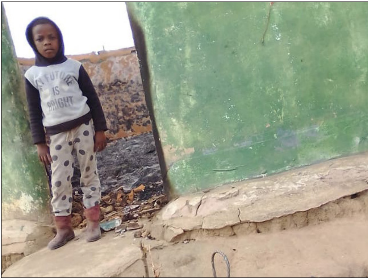
A young child stands amongst a fire damaged home