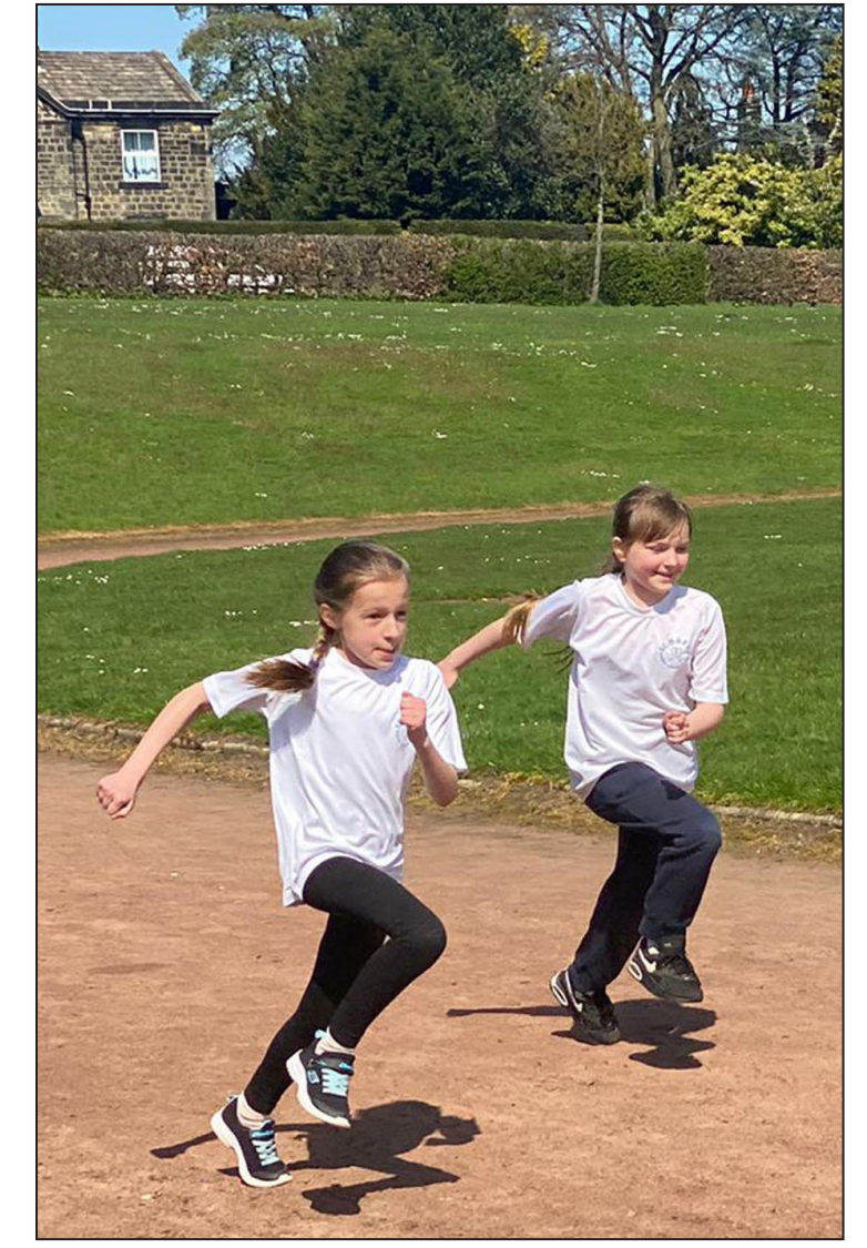
Children take part in a running session