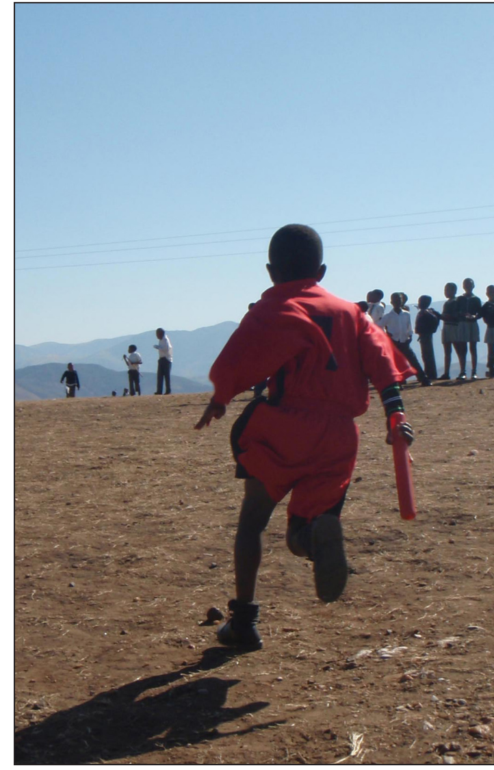
Bambisanani sporting activities

Those who wish to support declaration can sign it on the website sportforall.va