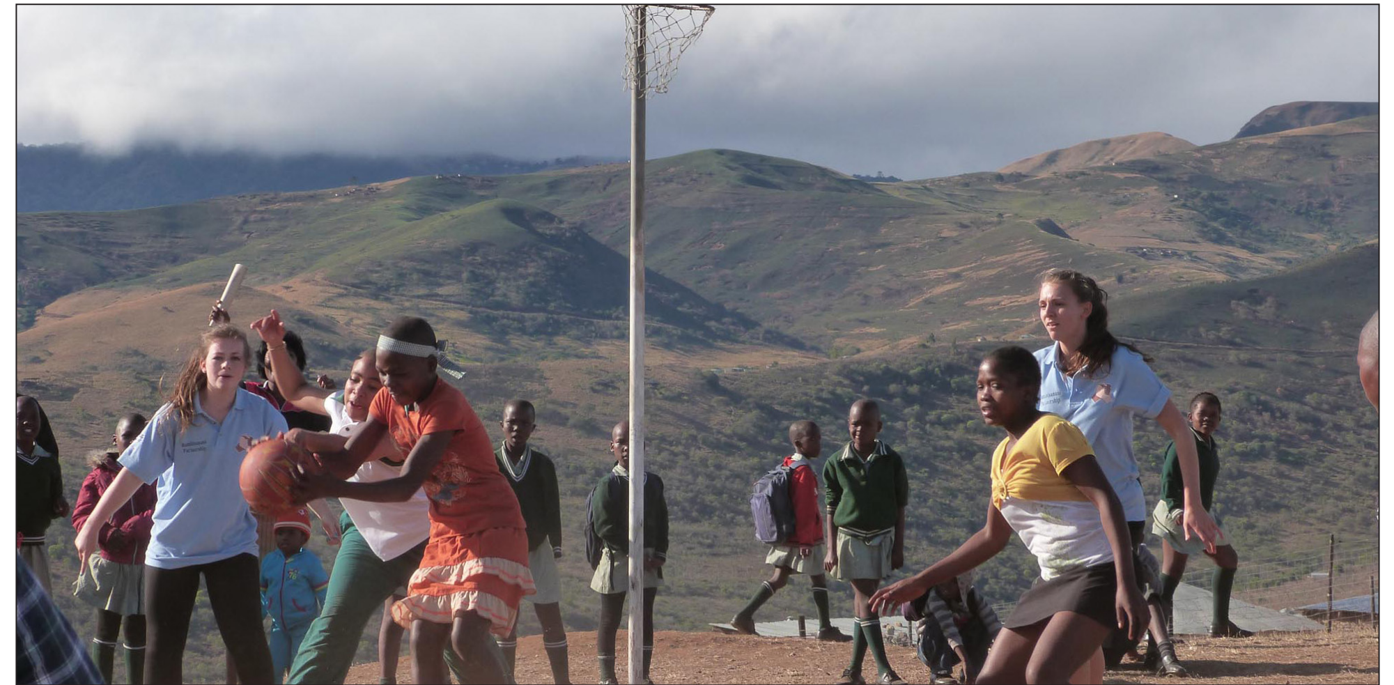
Sport bringing countries together

in good company. "The potential of high quality, inclusive physical education and sports programmes in our schools, colleges and universities to make a unique and significant contribution in this area is enormous."