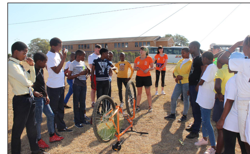
Learning how to maintain the bikes