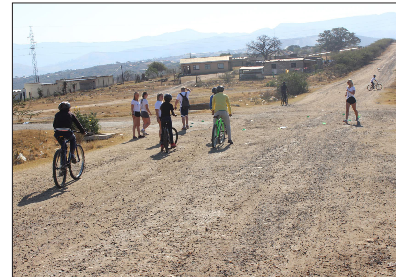
The project in action