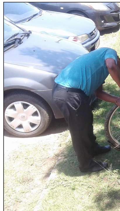
Checking the tyres

Professional world champion track and road racing cyclist, Lizzie Deignan, said: "I am inspired and excited to see the work being done by 'Cycling to Success'. In my case success is measured in medals and titles but in reality the most simple and brilliant success that the bicycle can give its rider is the victory of freedom. I am delighted that the opportunity to achieve freedom is being