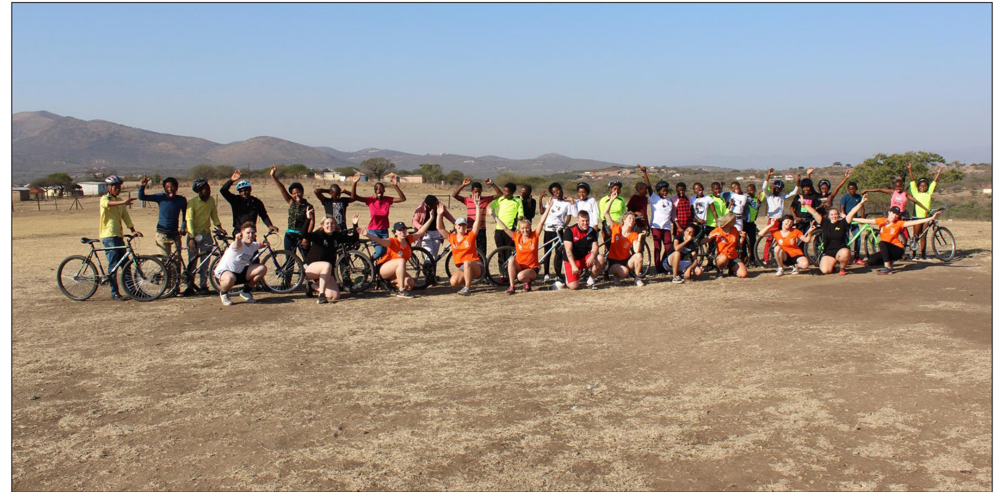
The Bambisanani 'Cycling to Success' initiative has taken cycling to an area of KwaZulu-Natal

renew their old bikes that had never been used for years and years. Some of those old bikes were brought to these young cyclists to fix them. We do not have enough words to pass on our gratitude and thanks to the University of Leeds and Leeds Trinity University for changing the lives of our young people."