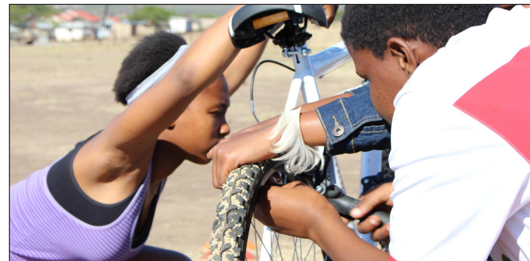
The Bambisanani 'Cycling to Success' initiative goes from strength to strength