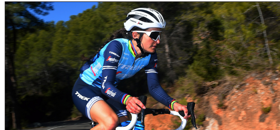
Lizzie Deignan in action.