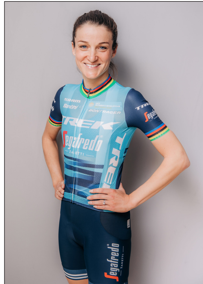
Lizzie Deignan.