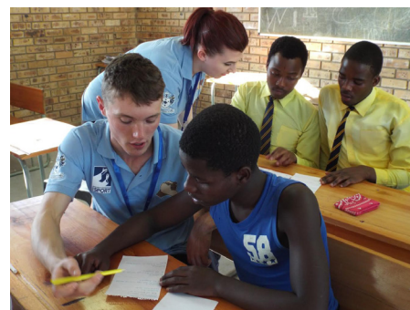
Working together, learning together

“I genuinely believe The Bambisanani Partnership has a truly positive impact on every single person involved. It was inspiring to see the determination, comradely and support on display, from both countries.”