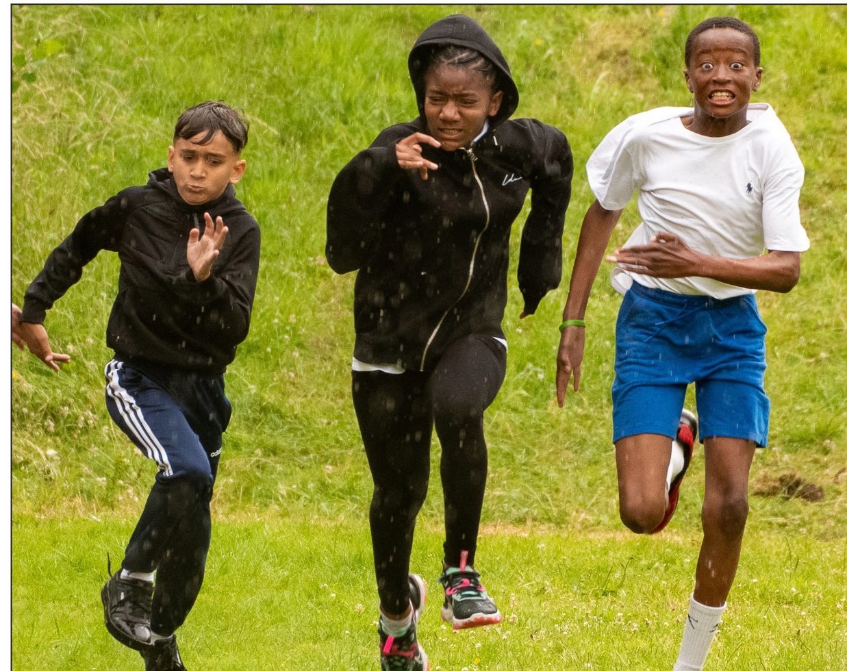
Pupils put huge effort into improving their performances