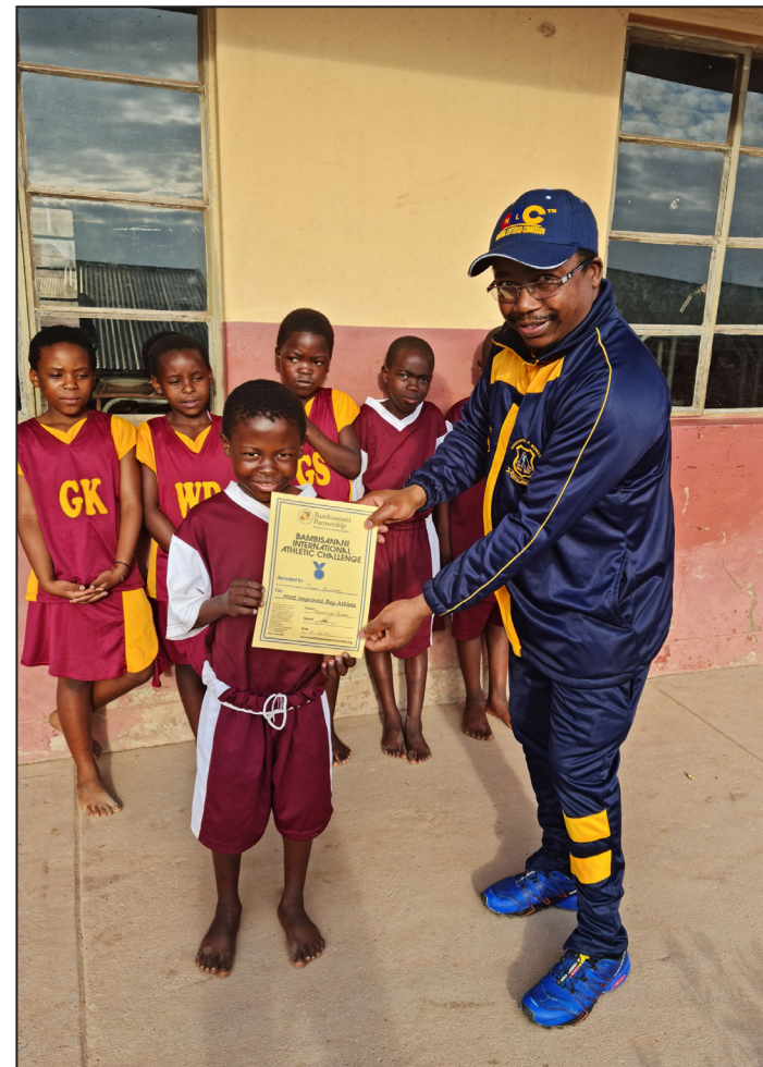
Handing over a certificate to a proud participant