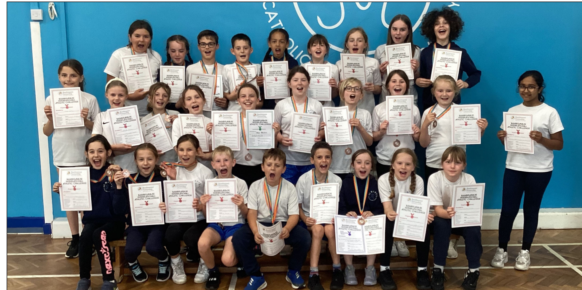
Participants proudly display their certificates

A remarkable 72 per cent of all learners involved made significant progress over time in at least three different events and were awarded special certificates to recognise this.