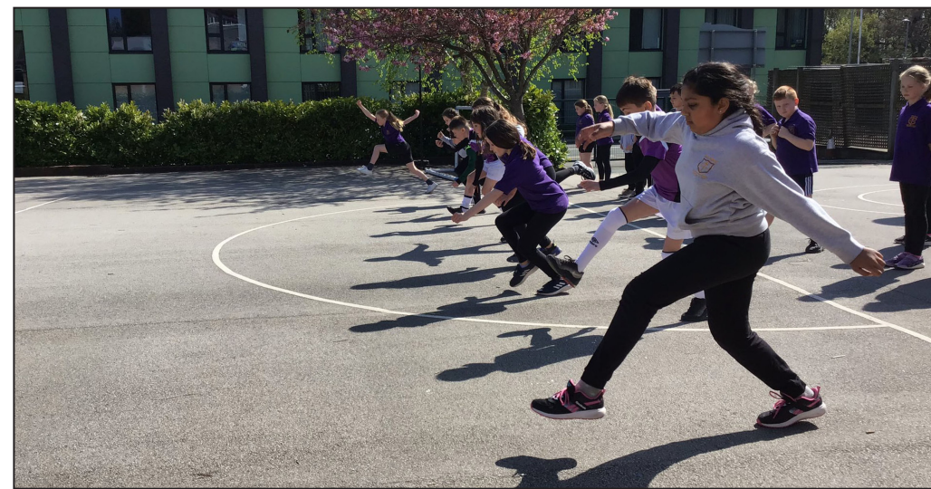
Students taking part in one of the athletics events

THE 2nd annual Bambisanani Partnership International Athletics Challenge, supported by the KwaZulu-Natal Department of Sport and Recreation, brought together 12 primary schools – six from rural KwaZulu-Natal in South Africa and six from the Leeds/Bradford area.