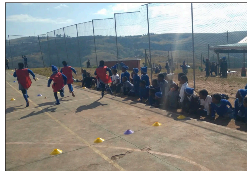
Students enjoyed competing in events

The Bambisanani Partnership is a multi-award-winning UK-based charity that originated as a partnership between St Mary's School in Menston, UK and Mnyakanya High School in rural KwaZulu-Natal, South Africa in 2006.