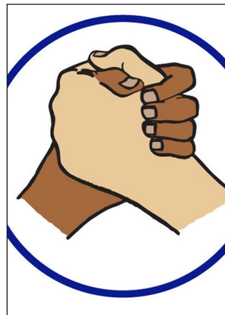
The partnership's logo

"A wide range awards reflect our values with certificates and medals available to learners in all participating schools for ex-