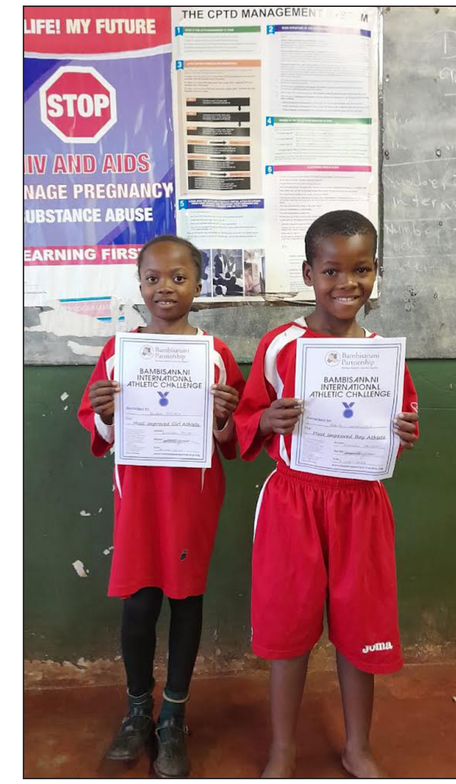
Students were rewarded with certificates for their performances