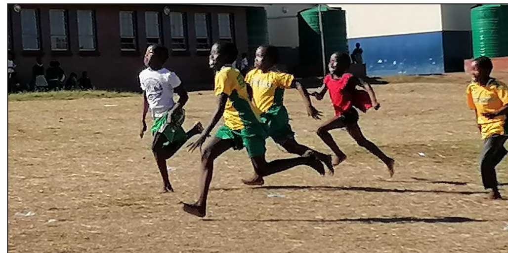
Competing in one of the races